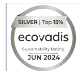
Ecovadis Silver Seal 2024