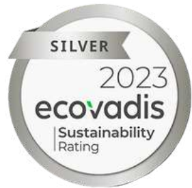
Ecovadis Silver Seal 2023