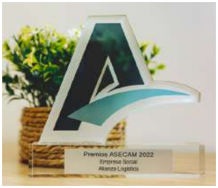
ASECAM Social Enterprise Award